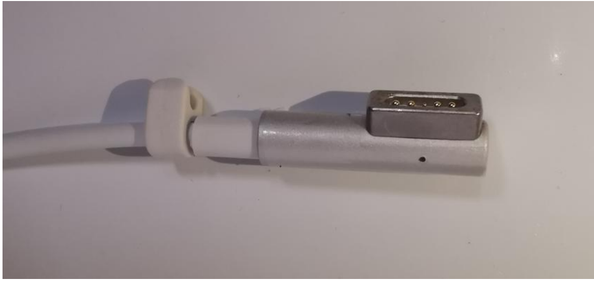
L-connector for 2008-2011 MacBooks, including 11", 13.3", 15.4" and 17" Macbook Air and Macbook Pro.