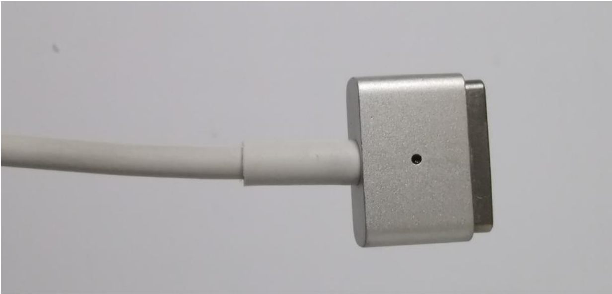
T-connector for 2012-2015 MacBooks , including 11", 13.3" and 15.4" Macbook Air and Macbook Pro