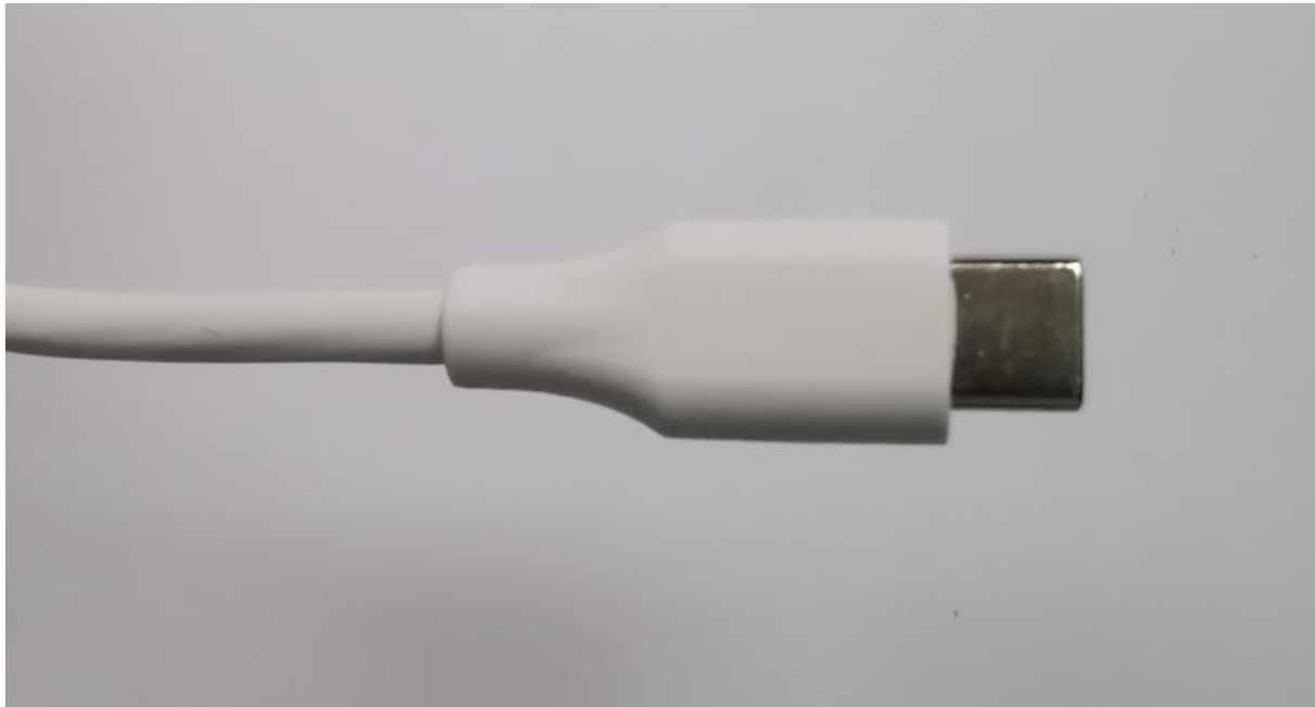
TYPE_C connector is suitable for 12", 13.3", 15.4" and 16" Macbook, Macbook Air and Macbook Pro in 2015-2022 (and supports fast charging of tablets and mobile phones with TYPE_C interface, check the current through the power meter to determine the fault).